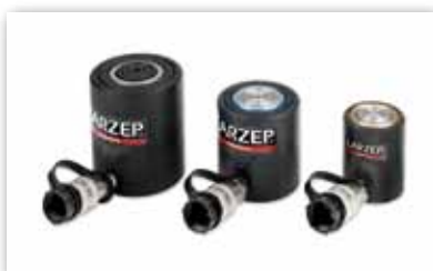
Low Height Single Acting Cylinders, SP.