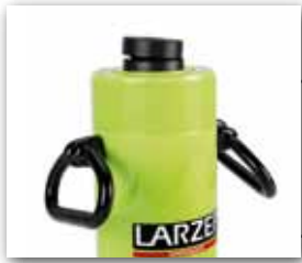
Optional Tilting Saddle.